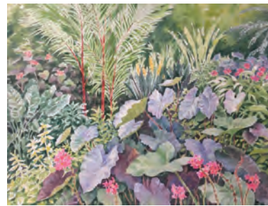
Hunte's Botanical Gardens, Barbados, 4 by Judith Croft watercolour 12" x 15"

Please make an appointment to view this Exhibition. sarahsamuelsfinepaintings@yahoo.co.uk | 0785 449 0220 | www.sarahsamuels.co.uk All paintings are available on receipt of this catalogue.