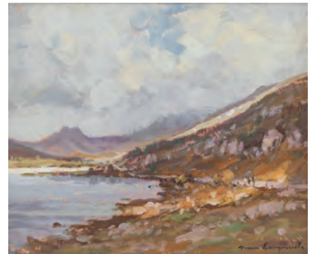
Snowdon Cloud over Llyn Mymbyr by James Longueville PS RBSA pastel 11" x 14"

Please make an appointment to view this Exhibition. sarahsamuelsfinepaintings@yahoo.co.uk | 0785 449 0220 | www.sarahsamuels.co.uk All paintings are available on receipt of this catalogue.