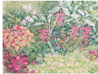
Hunte's Botanical Gardens, Barbados, 2 by Judith Croft watercolour 12" x 15"