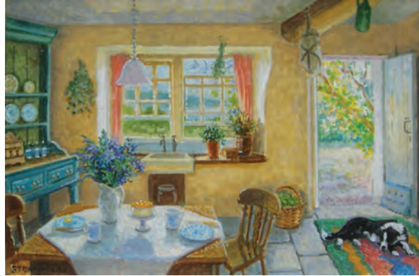
Summer Breeze by Stephen Darbishire RBA oil 8.5" x 5"