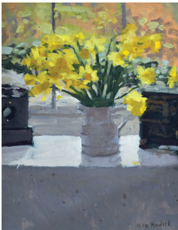
Light on the Window Sill by Ken Howard RA PPNEAC oil 12" x 10"