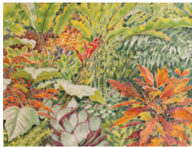
Hunte's Botanical Gardens, Barbados, 3 by Judith Croft watercolour 12" x 15"