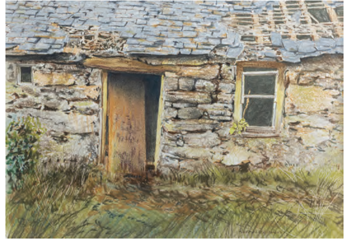
The Old Welsh Cottage by Alwyn Dempster-Jones pastel 10.5" x 13.5"