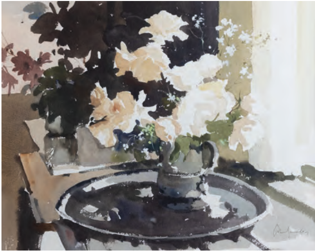
Roses by John Yardley RI watercolour 15" x 17.5"

The two watercolours below are reduced by 30%