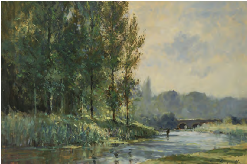
On the Windrush, Minster Lovell by James Longueville PS RBSA oil 24" x 36"

Four of these paintings are less than £1000