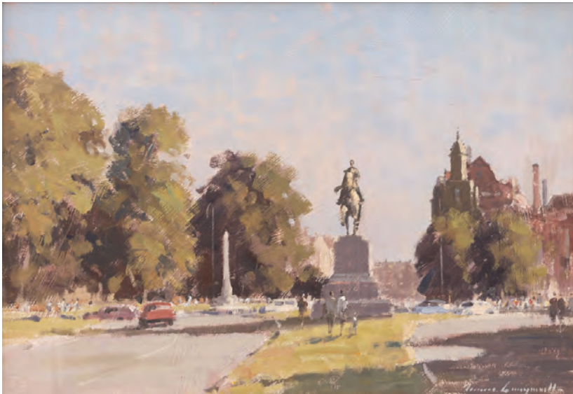
The Statue, Chester by James Longueville PS RBSA oil 14" x 20"