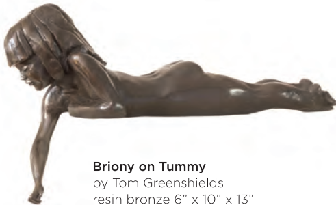
Briony on Tummy by Tom Greenshields resin bronze 6" x 10" x 13"