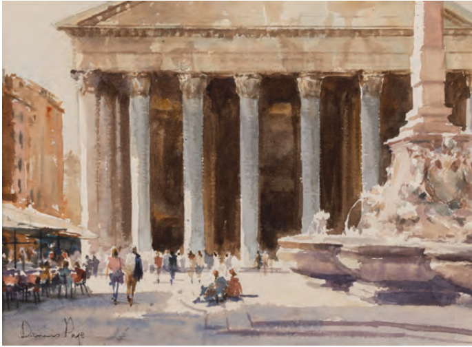
Pantheon, Rome by Dennis Page watercolour 10" x 13.5"