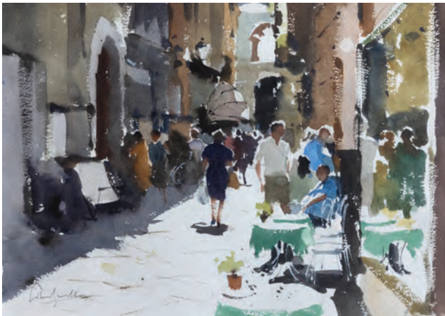
Side Street in Sorrento by John Yardley RI watercolour 10" x 13.5"