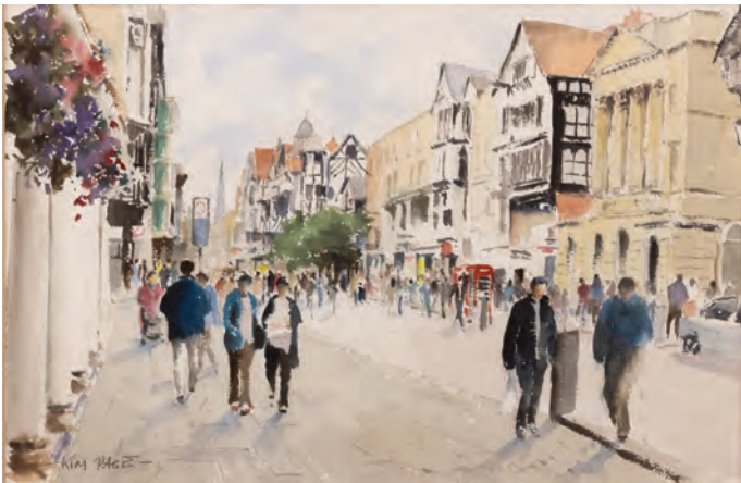
Eastgate Street, Chester by Kim Page watercolour 13.5" x 21"