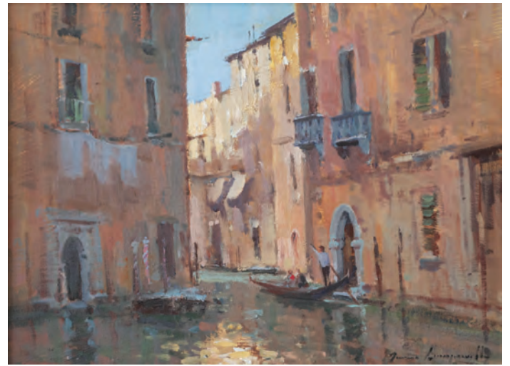
A Back Canal, Venice by James Longueville PS RBSA oil 12" x 16"