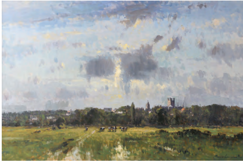
Earl's Eye, Chester Meadows by James Longueville PS RBSA oil 32" x 48"