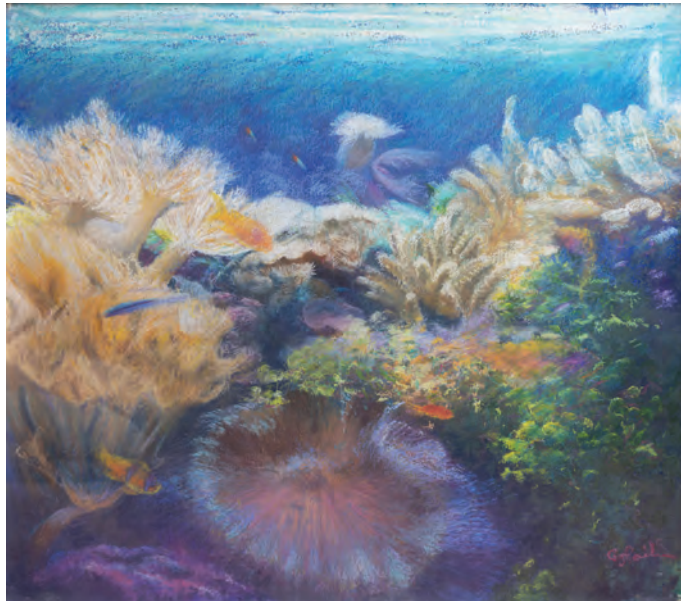
Coral Reef by Graham Painter oil and pastel 30" x 34"

Please make an appointment to view this Exhibition. sarahsamuelsfinepaintings@yahoo.co.uk | 0785 449 0220 | www.sarahsamuels.co.uk All paintings are available on receipt of this catalogue.