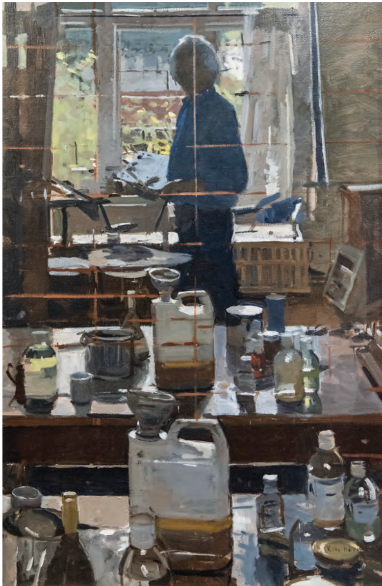
Studio Portrait by Ken Howard RA PPNEAC oil 30" x 20"