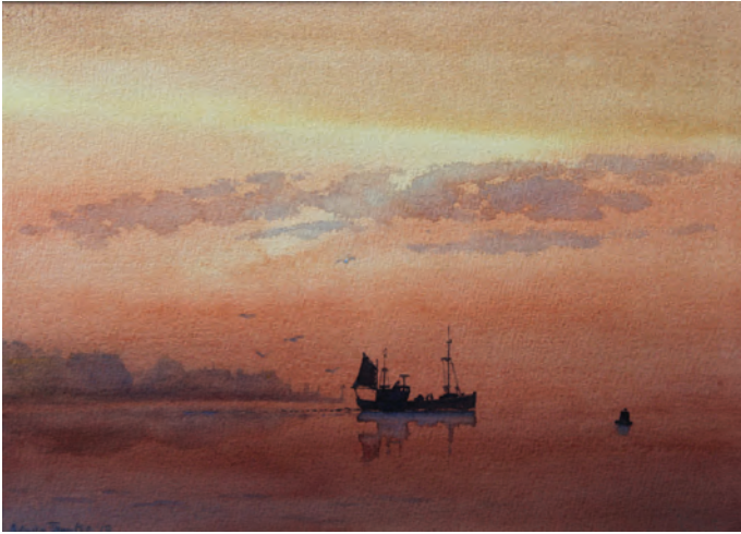
Dawn Departure by Adrian Taunton watercolour 10" x 14"

Each of these watercolours is less than £600