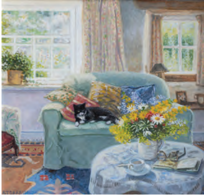
Monty by Stephen Darbishire RBA oil 7" x 7"