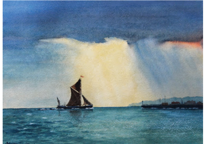
Approaching Storm by Adrian Taunton watercolour 10" x 14"