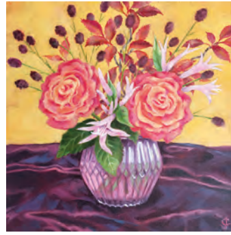
Flowers on Indian Silk, 3 by Judith Croft oil 12" x 12"