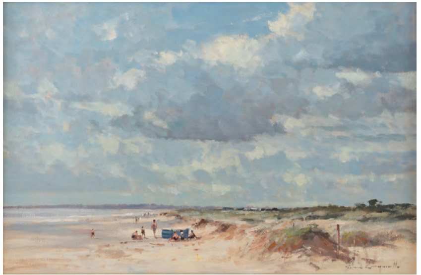
The Beach at Walberswick by James Longueville PS RBSA oil 12" x 18"