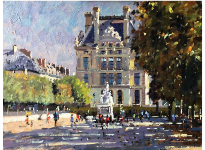
October Sun, Jardin des Tuileries by Bruce Yardley oil 12" x 16"