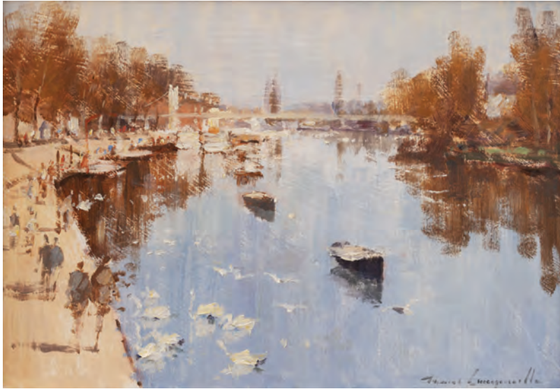
Winter Light, Chester by James Longueville PS RBSA oil 10" x 14"