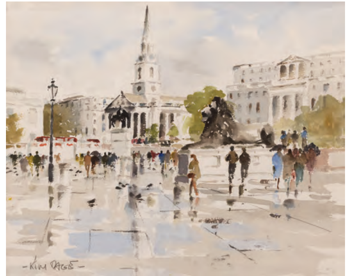
Trafalgar Square, London by Kim Page watercolour 12" x 14"

Please make an appointment to view this Exhibition. sarahsamuelsfinepaintings@yahoo.co.uk | 0785 449 0220 | www.sarahsamuels.co.uk All paintings are available on receipt of this catalogue.