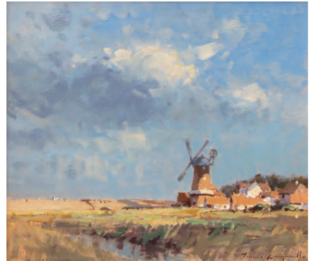
Cley Mill by James Longueville PS RBSA oil 14" x 16"

Please make an appointment to view this Exhibition. sarahsamuelsfinepaintings@yahoo.co.uk | 0785 449 0220 | www.sarahsamuels.co.uk All paintings are available on receipt of this catalogue.