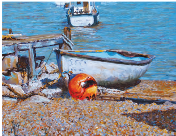
The Red Buoy by Margaret Glass PS pastel 13" x 17"