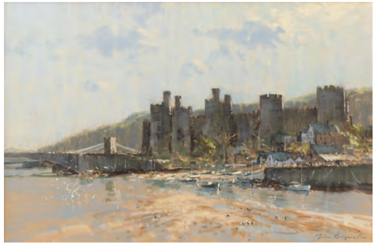
Low Tide, Conwy by James Longueville PS RBSA pastel 16" x 24"