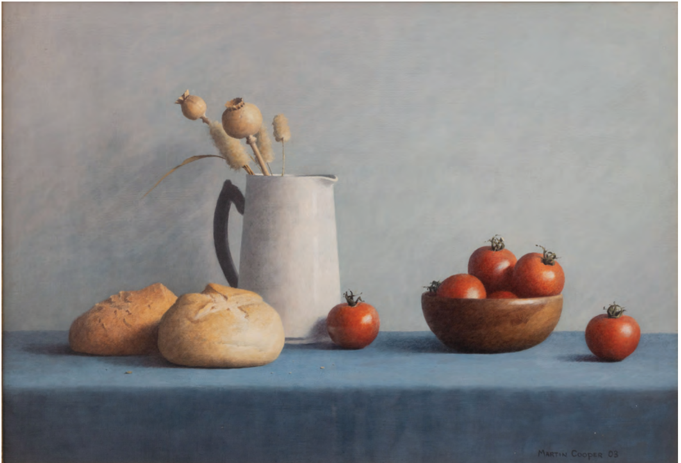
Milk Jug, Bread and Tomatoes

AUTUMN AND WINTER EXHIBITION 2022 - 2023