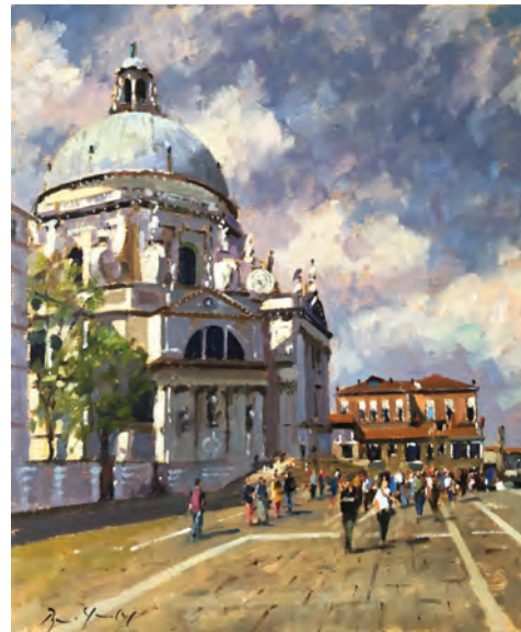
Campo della Salute, Venice by Bruce Yardley RI oil 24" x 20"

Please make an appointment to view this Exhibition. sarahsamuelsfinepaintings@yahoo.co.uk | 0785 449 0220 | www.sarahsamuels.co.uk All paintings are available on receipt of this catalogue.