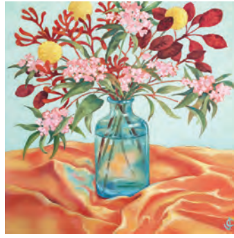
Flowers on Indian Silk, 2 by Judith Croft oil 12" x 12"