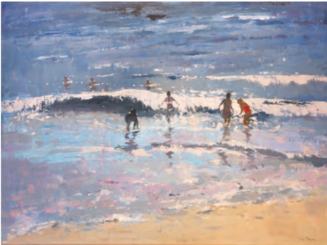
Splash! by Tina Morgan SWA SWAc oil 30" x 40"