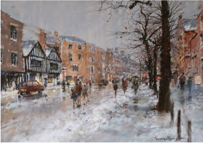
Lower Bridge Street in Snow, Chester by George Thompson PS pastel 24" x 30"

These paintings are between £250 and £550