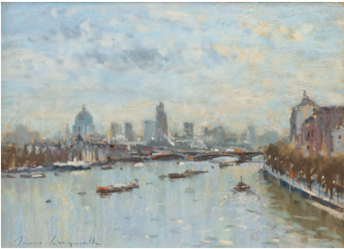
City from Waterloo Bridge by James Longueville PS RBSA pastel 11" x 15"