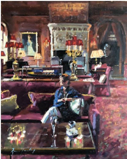
Champagne, The Great Hall, Clivedon by Bruce Yardley oil 20" x 16"