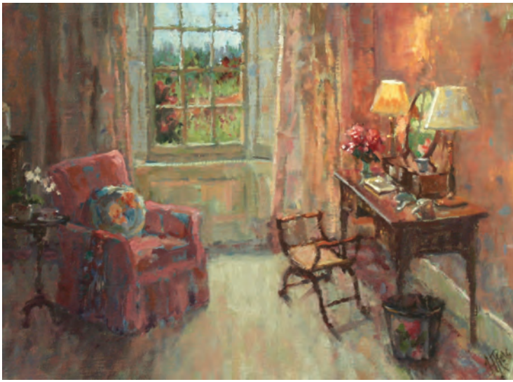
Guest Room Corner by Hope Reis oil 12" x 16"