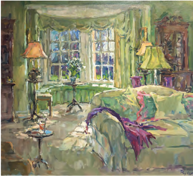
The Bow Window by Susan Ryder RP NEAC oil 20" x 22"