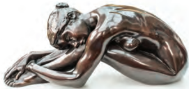
Chrissie Resting by Tom Greenshields resin bronze 5" x 11.5" x 4"