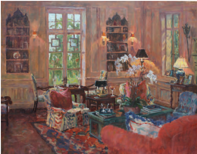
La Salona, Lamplight by Hope Reis oil 22" x 28"