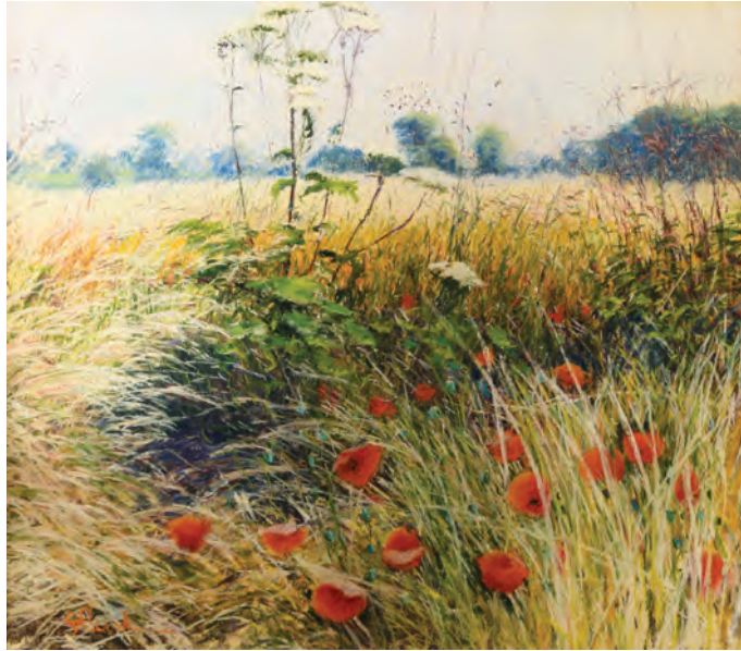
Poppies in the Meadow by Graham Painter oil and pastel 29" x 33"

50% reduction on each of these two paintings