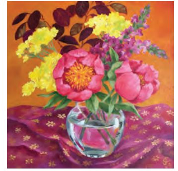
Flowers on Indian Silk, 4 by Judith Croft oil 12" x 12"

Each of these four watercolours is less than £400