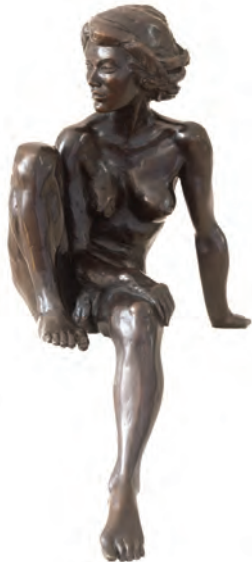
Pip by Tom Greenshields resin bronze 15" x 9" x 9"