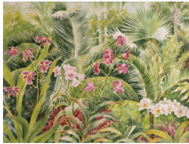
Hunte's Botanical Gardens, Barbados, 1 by Judith Croft watercolour 12" x 15"

Each of these four watercolours is less than £400