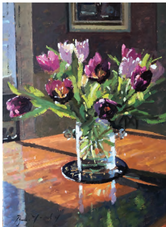
Tulips and Glass by Bruce Yardley oil 16" x 12"