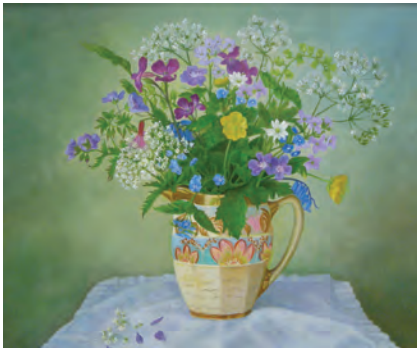
Rebecca's Flowers by Rebecca Darbishire LAS oil 9.5" x 11.5"