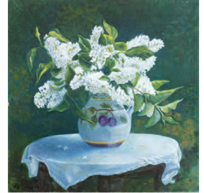
Lilac by Rebecca Darbishire LAS oil 7" x 7"