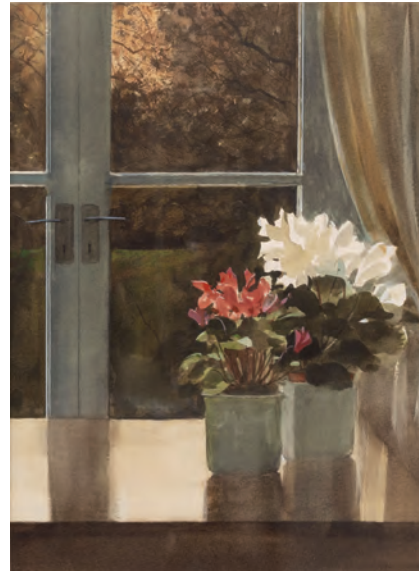
Midwinter's Day by Michael Felmingham watercolour 14" x 10"

Please make an appointment to view this Exhibition. sarahsamuelsfinepaintings@yahoo.co.uk | 0785 449 0220 | www.sarahsamuels.co.uk All paintings are available on receipt of this catalogue.