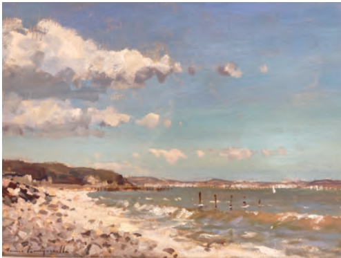
Towards Llandudno by James Longueville PS RBSA oil 14" x 22"