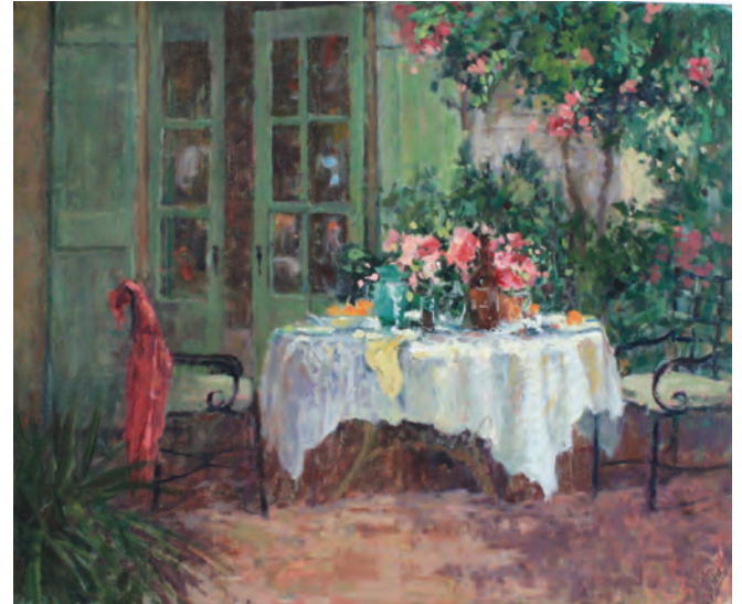
Garden Flowers by Hope Reis oil 20" x 24"

Please make an appointment to view this Exhibition. sarahsamuelsfinepaintings@yahoo.co.uk | 0785 449 0220 | www.sarahsamuels.co.uk All paintings are available on receipt of this catalogue.