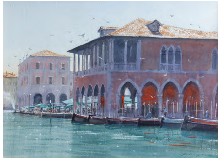
The Fish Market, Venice by Michael Felmingham watercolour 12.5" x 17"

Please make an appointment to view this Exhibition. sarahsamuelsfinepaintings@yahoo.co.uk | 0785 449 0220 | www.sarahsamuels.co.uk All paintings are available on receipt of this catalogue.