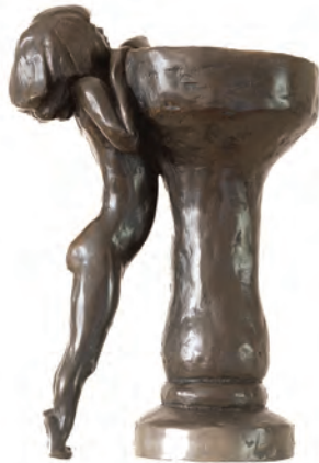
Birdbath by Tom Greenshields resin bronze 8" x 5" x 4"