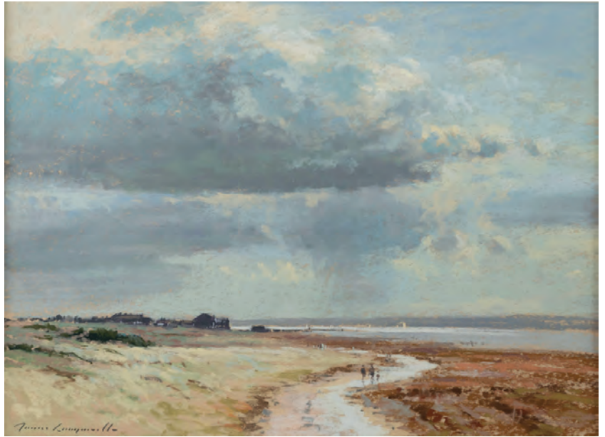
Showers over the Estuary by James Longueville PS RBSA oil 12" x 18"

Please make an appointment to view this Exhibition. sarahsamuelsfinepaintings@yahoo.co.uk | 0785 449 0220 | www.sarahsamuels.co.uk All paintings are available on receipt of this catalogue.