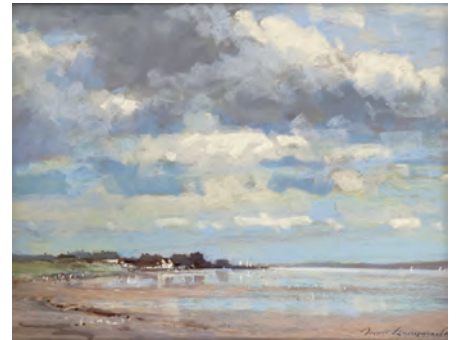
Low Tide, Dee Estuary by James Longueville PS RBSA pastel 11" x 14"