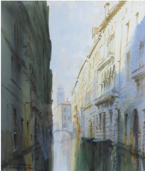
Afternoon Reflections, Venice by Michael Felmingham watercolour 12.25" x 10.74"