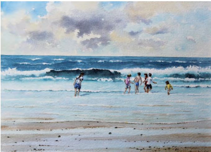
Dodging the Spray by Adrian Taunton watercolour 10" x 14"