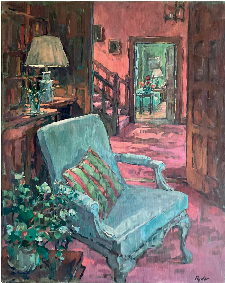
Through the Red Hall by Susan Ryder RP NEAC oil 30" x 24"

Please make an appointment to view this Exhibition. sarahsamuelsfinepaintings@yahoo.co.uk | 0785 449 0220 | www.sarahsamuels.co.uk All paintings are available on receipt of this catalogue.