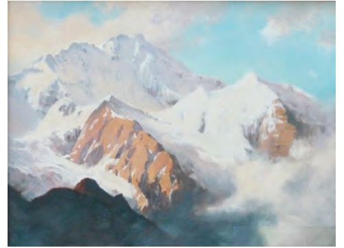
Morning Light on Jungfrau from Wengen by Vivienne Pooley LAS watercolour 12" x 16"