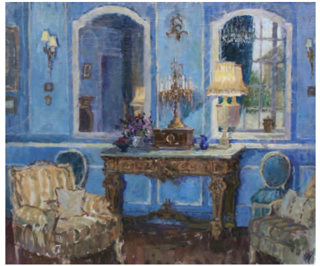
Blue Reflections by Hope Reis oil 20" x 24"