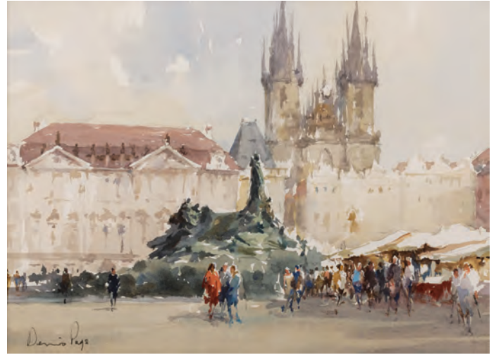
The Church of Our Lady Before Tyn, Prague by Dennis Page watercolour 10" x 13.5"