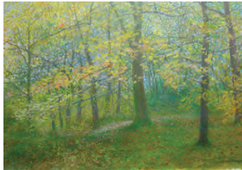
Falling Leaves by Stephen Darbishire RBA oil 12" x 15.5"