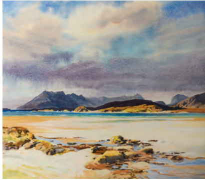
View of the Cuillins by Vivienne Pooley LAS watercolour 19.5" x 22.5"