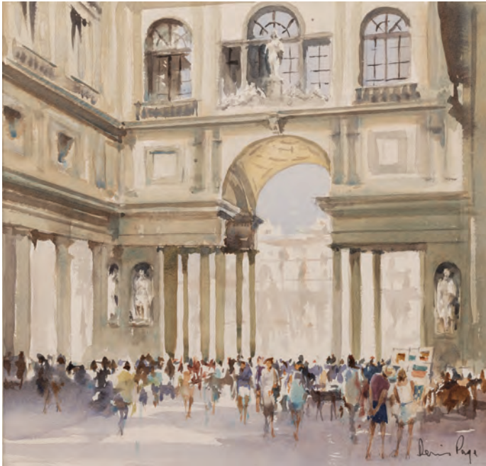
Uffizi Arcade, Florence by Dennis Page watercolour 13" x 13.5"