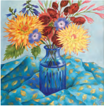
Flowers on Indian Silk, 1 by Judith Croft oil 12" x 12"

Each of these four oils is less than £600