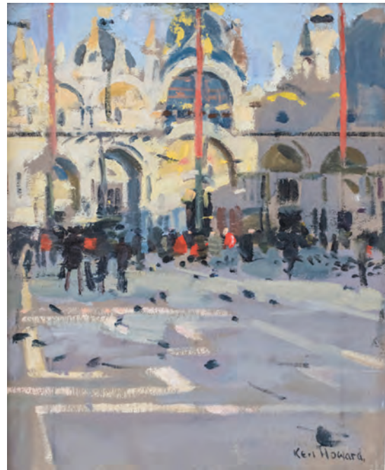
San Marco, Sunlight and Shade by Ken Howard RA PPNEAC oil 12" x 10"