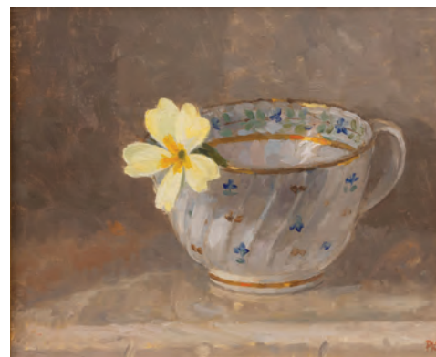
Cup and Primrose by Pamela Kay NEAC oil 6" x 7"

Please make an appointment to view this Exhibition. sarahsamuelsfinepaintings@yahoo.co.uk | 0785 449 0220 | www.sarahsamuels.co.uk All paintings are available on receipt of this catalogue.