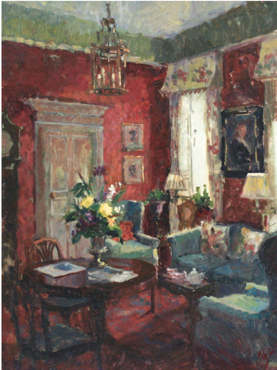
Middlethorpe Hall, North Drawing Room