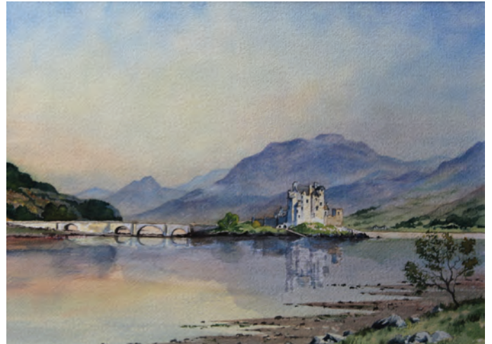
Eilean Donan Castle by Adrian Taunton watercolour 10" x 14"

Please make an appointment to view this Exhibition. sarahsamuelsfinepaintings@yahoo.co.uk | 0785 449 0220 | www.sarahsamuels.co.uk All paintings are available on receipt of this catalogue.