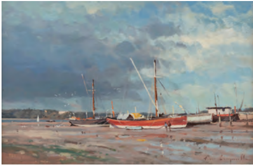
Rainclouds, Pin Mill by James Longueville PS RBSA oil 18" x 24"